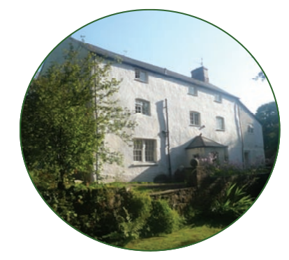
Church Farm Guesthouse