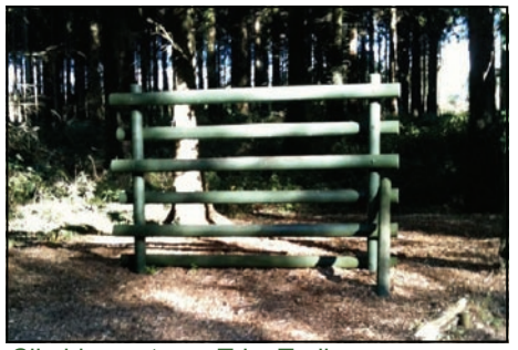
Climbing gate on Trim Trail

From the car park (1) turn right along the forest road with mainly Larch trees to the left and Douglas Fir on the right. There are Glanau Wood at least a dozen different tree species along the route. Why not bring a tree identification book along with you? Children can have fun collecting all the different leaves.