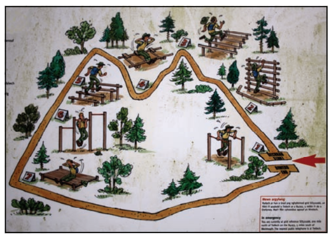
Trim trail map by car park

Interspersed along the main track is a Trim Trail consisting of various wooden adventure structures, such as a gate climb and stride jumps, that most age groups will enjoy. Dog walkers are asked to be aware of runners and other users of the Trim Trail and to ensure that their dogs do not foul the safety chippings beneath the structures.