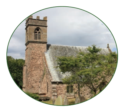
Church of St Michael and All Angels